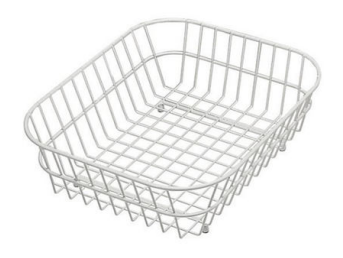
Cestello inox 8612 000